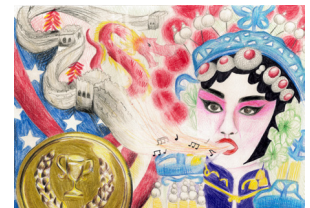
My Culture, My Roots