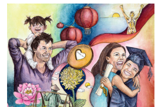
My Road of Opportunity Constructed By My Parent's Diligence